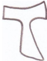
Community of St. Francis