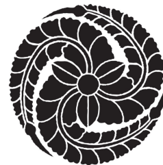
THE BERKELEY ZEN CENTER